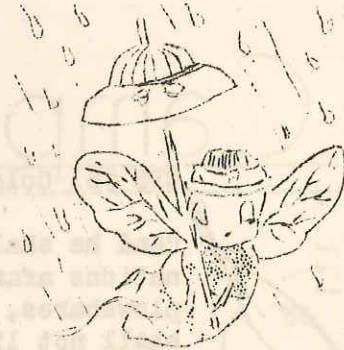
A QUEEN BEE

The Colorado Youth Conference sponsored by the Old Mennonite Church will be held from August 31 to Sept. 2, at the Pueblo Mountain Park, Beulah, Colorado. An extensive program has been planned for this time. There will be no charges for CPS men. Anyone interested in attending this conference over the week-end should notify the director by Aug. 21. Further information will be found on the Bulletin Board.