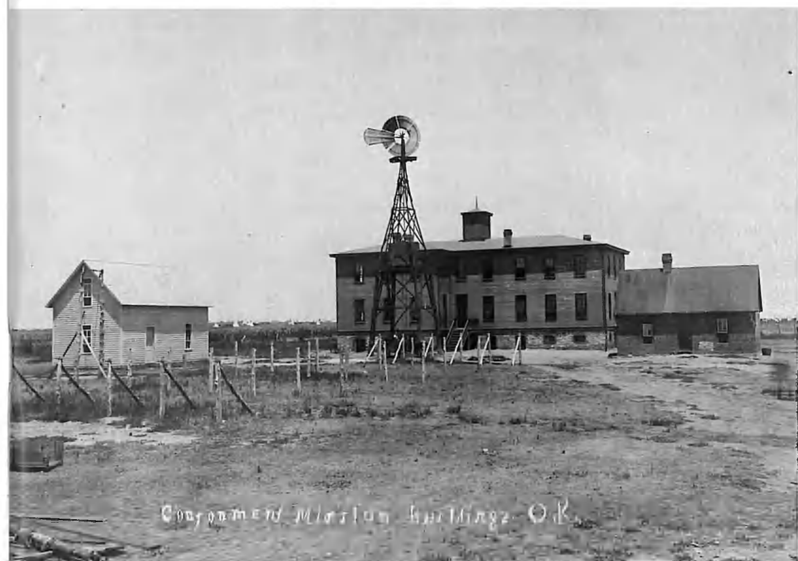
Cantonment Mission buildings O.K.