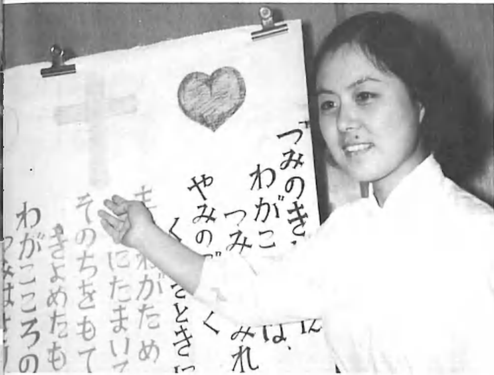
Upper left. A youth Sunday School class at Miyazaki.