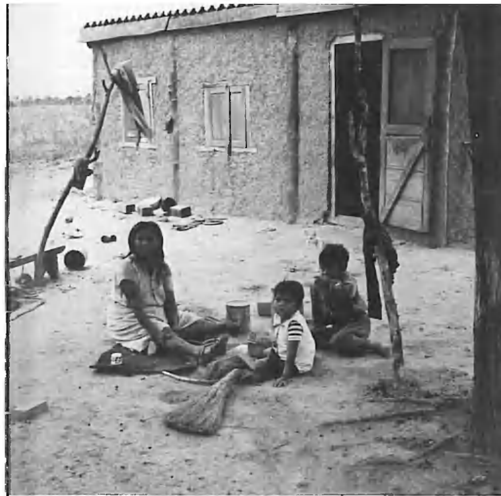
Upper left. Indians who live on the reservation established by the mission society, Light to the Indians.