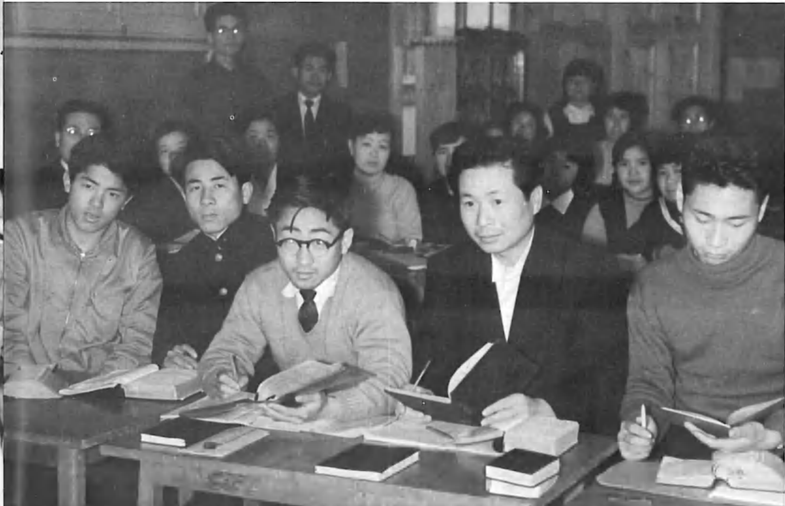
Lower right. Class time at spring Bible School in Miyazaki.