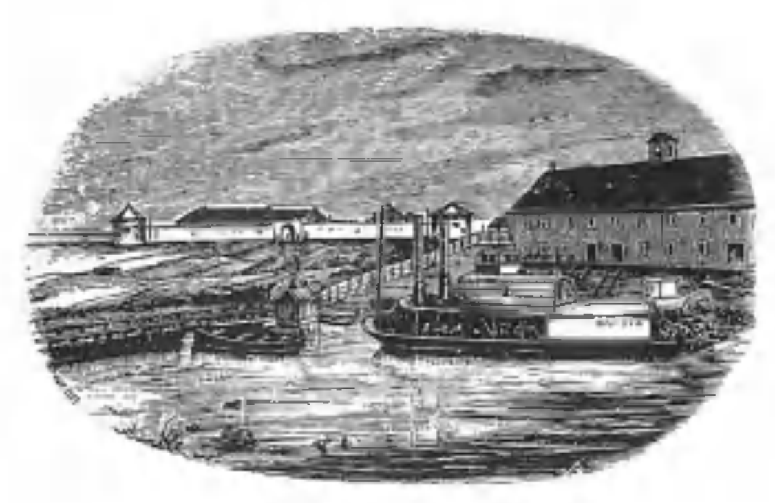
Fort Garry (Winnipeg) in 1876