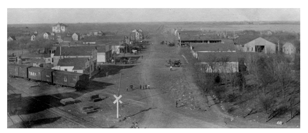
Can anyone identify this small town? The boxcar labeled "T&BV" is from the Trinity and Brazos Valley railroad in Texas. See detail of the institutional building in the background below.

Left: Can anyone say anything about this religious telescope? Note the flooding at the base. The signature on the photo seems to be "W. H. Dyck."