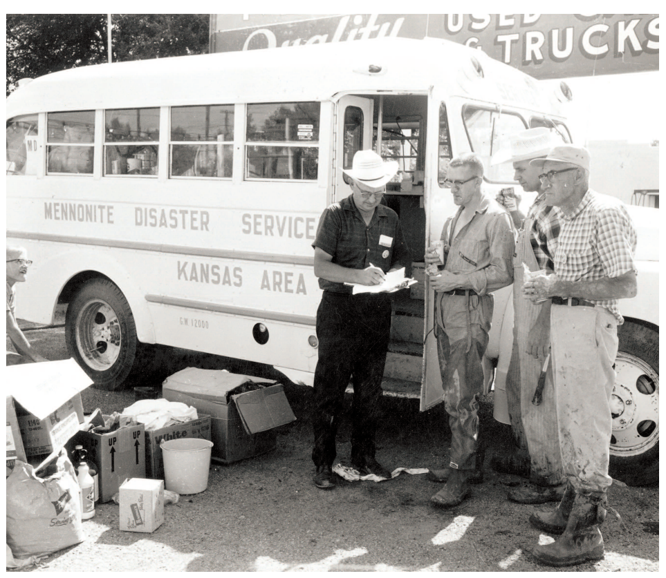
This is supposed to be a group working on Newton, Kansas, flooding in June 1965. Can anyone identify the people and the specific location?